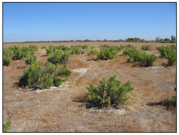
FIGURE 2. Typical shrub density and fall ground cover conditions on the Unit 15 study area, Kern National Wildlife Refuge, California. The shrubs visible in the image are all Iodine Bush ( Allenrolfea occidentalis ). The south plot is shown but conditions on the north plot were similar.

Traps Inc., Tallahassee, Florida) spaced 15 m apart. We opened the traps within 2 h of sunset and we provisioned each trap with a handful of millet seed and two sheets of crumpled unbleached paper towel for insulation and preoccupation. We checked and closed the traps the following morning within 2 h of sunrise. For the first capture of each animal, we recorded species, sex, age, and reproductive condition, and we marked each animal ventrally with a non-toxic felt-tipped pen. At first capture, we weighed kangaroo rats and released them at the capture site. We trapped for rodents 30–31 October 2018 for a total of 160 trap-nights on each plot.