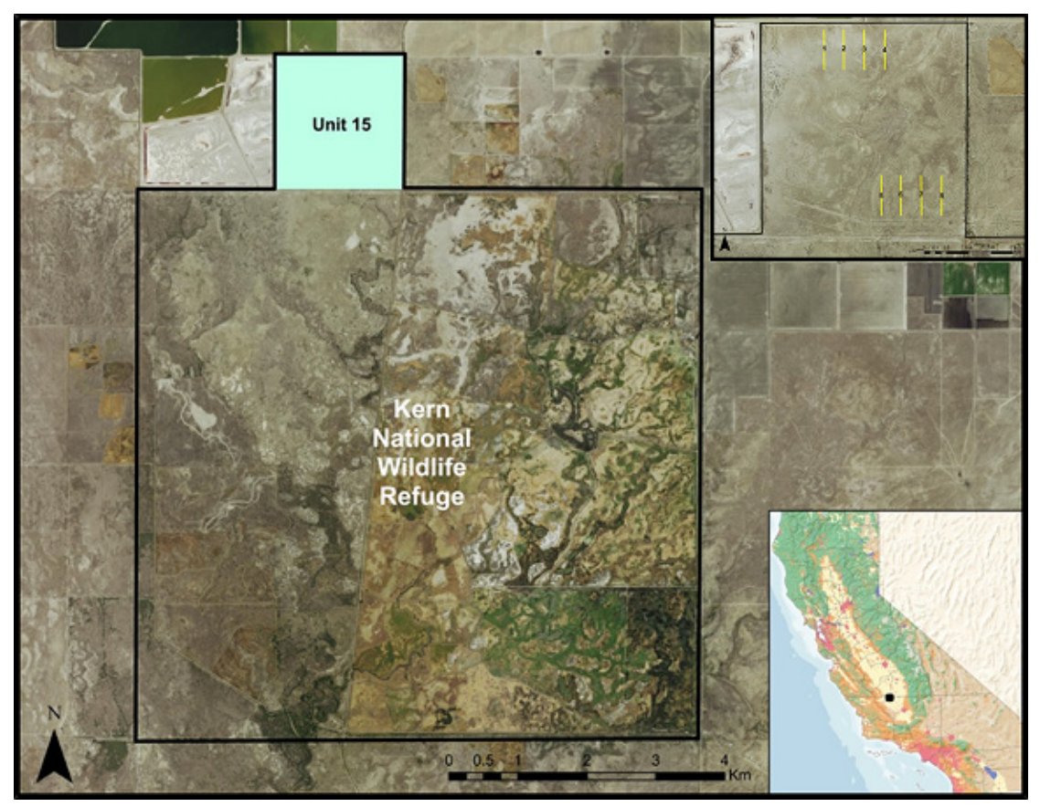
FIGURE 1. Unit 15 study area at the Kern National Wildlife Refuge in Kern County, California. The top inset shows the location of the two study plots on Unit 15, each consisting of four traplines.

Cypher et al. • Tipton kangaroo rats and shrubs.